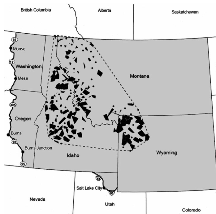
Figure 1. Boundaries of the Northern Rocky Mountain Distinct Population Segment (NRM DPS) as identified in the April 2009 delisting rule for the gray wolf (gray shading); distribution map of existing wolf packs as of 2007 (dark polygons); and location of core recovery area (dashed line) as published in the Federal Register (USFWS 2009b).

Across the three-state NRM region in 2008, biologists documented that wolves killed 214 cattle, 355 sheep, 28 goats, 21 llamas, 10 horses, and 14 dogs; but the same year, a single severe storm killed more than 1200 calves and lambs (USFWS 2009a). A recent study found that only 3 percent of all livestock losses in the northern Rockies were due to all native predators combined (Van Camp 2003). Worldwide, livestock losses to wild canids generally total less than 2 percent of all losses in a given year, regardless of canid population densities (Alderton and Tanner 1994). Records compiled by the